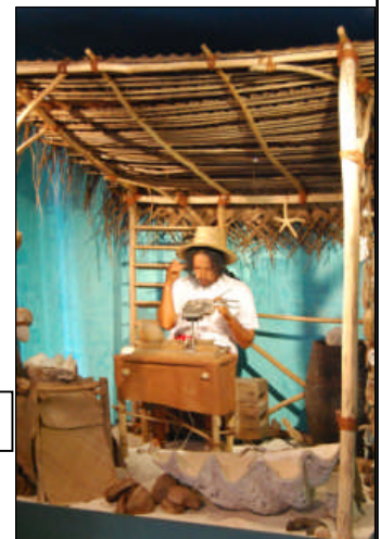
Famed Robert Wan Pearl Museum

TASC will create a unique adventure and find a special way for you to discover French Polynesia; more natural ...wilder. A fauna and a flora that will take your breath away, turquoise lagoons with unspoiled beaches to Discover!!!