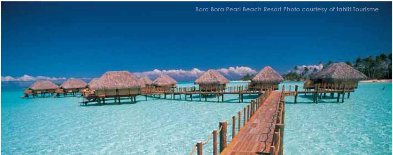
Bora Bora Pearl Beach Resort

from hotels to entertainment, security details, ground transportation and excursions.